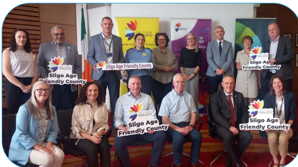
Sligo Age Friendly Alliance pictured at the May 2025 meeting with An Cathaoirleach and staff of Sligo Council and representatives from Sligo Older Peoples Council, HSE, An Garda Síochána, Local Link, MSLETB, Sligo Leader Partnership Co, Sligo Sports and Recreation Partnership, ATU Sligo and Age Friendly Ireland