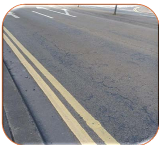
N4 Inner Relief Road – Pavement showing rutting and cracking in wheel tracks, with significant wear on antiskid surface.

In house design work is ongoing for the N59 Tullylin to Fiddaun pavement scheme, which is scheduled for delivery in 2026, subject to funding and resources.