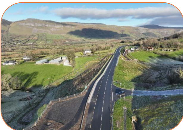
N16 Mainline at Lugatober

The new N16 Lugatober road and its associated active travel facilities are now open to the public. There are some outstanding elements and works of a seasonal nature. This work will be completed over the coming months. On completion, the project will be entering Phase 7 – Close Out and Review.