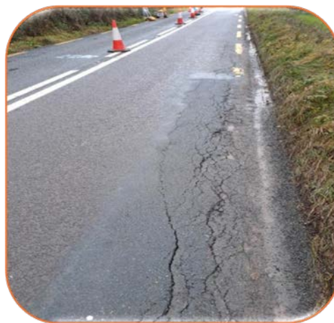
N16 Lugatober to Co. Boundary – Significant structural distress in the nearside edge and wheel track.

In house design work is ongoing for the N59 Tullylin to Fiddaun pavement scheme, which is scheduled for delivery in 2026, subject to funding and resources.