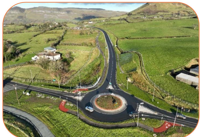
New Active Travel Facilities at Drum Road Roundabout