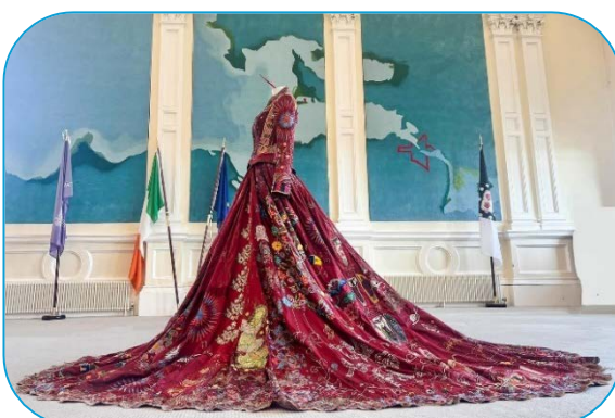
The Red Dress, Sligo City Hall

The Red Dress Embroidery Project made its first visit to Ireland as a centrepiece of the PEACEPLUS Launch celebrations. A fitting example of collaboration involving 381 people from 51 countries, the red Dress raised the promotion of participation and engagement in the Sligo PEACEPLUS projects.